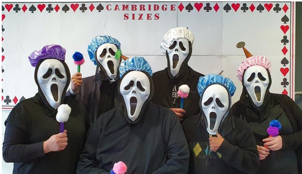
I Scream (for Ice Cream)

Cambridge Results Go to 'Events older than 60 days'