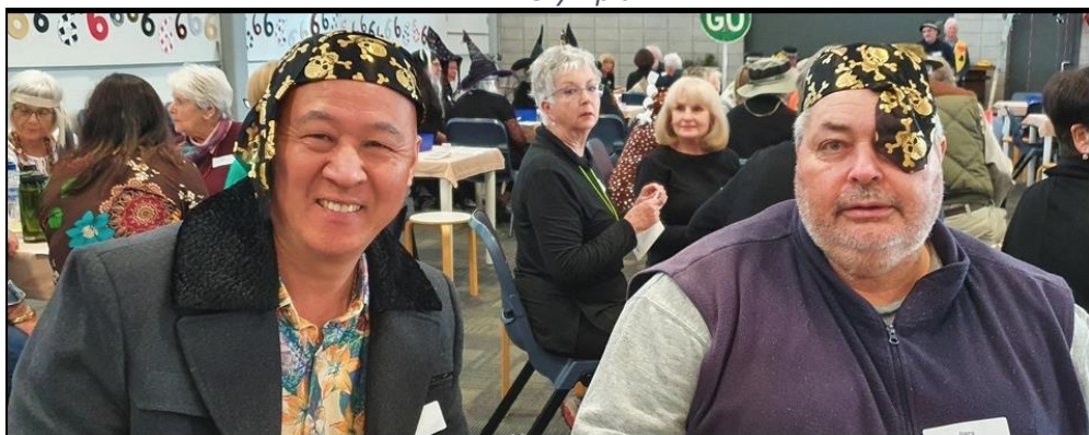
A pair of Pirates